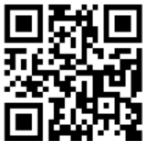
DSC website link for additional event photos

Stop in any Friday and check out either or both. Or use the contact info on the previous page.